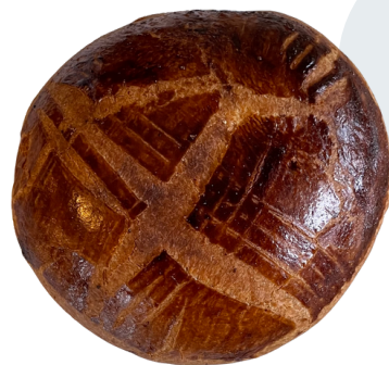
Plain Turkish Bun (Sade Poğaç) 2.49

Acma is a soft, fluffy Turkish pastry that resembles a bagel but with a lighter, more tender texture. This delightful bread is slightly sweet, rich with buttery layers.