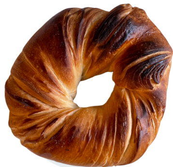
Turkish Croissant (Açma) 2.49

Simit is a circular bread encrusted with sesame seeds, offering a delightful crunch and a slightly sweet, nutty flavor. Lighter and crispier than the regular bagel.