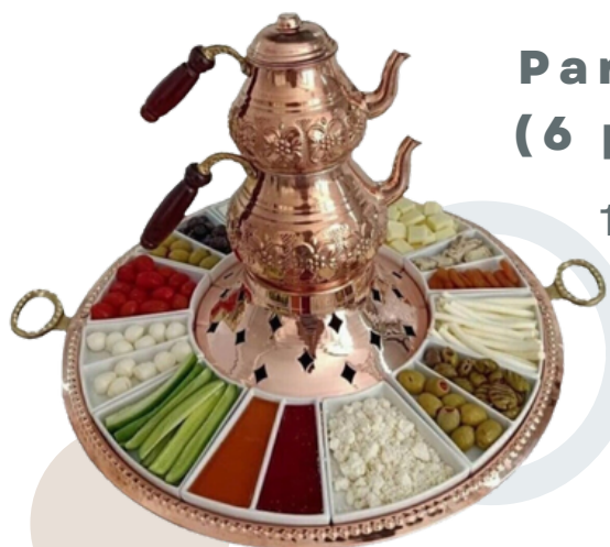
Party Size (6 people) 119.99

A variety of premium cheeses, olives and spreads, sigara borek (fried thin roll), mixed greens, breakfast potatoes, and bread. Comes with two small egg pans (choose from sucuk or menemen) or kavurma (+$3) or pastirma (+$3) Served with a small pot of tea or coffee