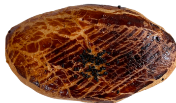
Turkish Bun with Olives (Zeytinli Poğaç) 2.49

Pogaca is a savory Turkish pastry that's soft, fluffy, and often filled with ingredients like cheese, olives, or minced meat. These little buns are a staple in Turkish cuisine, known for their buttery texture and slightly tangy flavor, thanks to the use of yogurt or feta cheese in the dough. Pogaca serves as a beloved breakfast item, tea-time snack, or a warm appetizer, embodying the comforting essence of home-cooked Turkish fare.