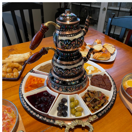
Family Size (4 people) 79.99

A variety of premium cheeses, olives and spreads, sigara borek (fried thin roll), mixed greens, breakfast potatoes, and bread.