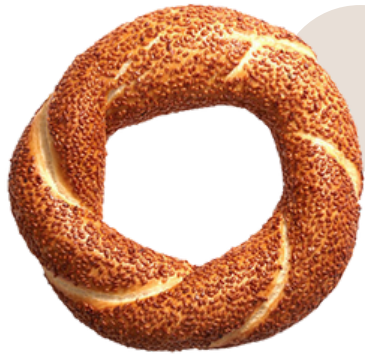
Turkish Sesame Bagel (Simit) 2.49

Simit is a circular bread encrusted with sesame seeds, offering a delightful crunch and a slightly sweet, nutty flavor. Lighter and crispier than the regular bagel.