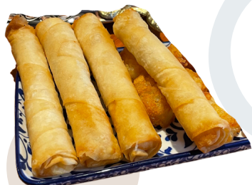
Rolled Pastry (4 pieces) (Sigara böreği) 3.99

Sigara boregi features phyllo dough filled with feta cheese and parsley, rolled into cigar shapes and fried or baked to a crispy golden brown.