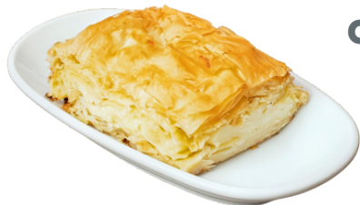
Cheese Pastry (Su böreği) 4.99

Su boregi is a classic Turkish layered pastry, combining flaky phyllo dough with a savory cheese and parsley filling. Its distinctive texture, both crispy and tender, comes from boiling the dough layers before baking.