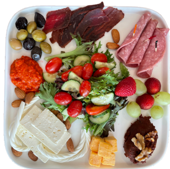
Breakfast Platter 19.99

A variety of premium cheeses, olives and spreads, sigara borek (fried thin roll), mixed greens, breakfast potatoes, and bread.